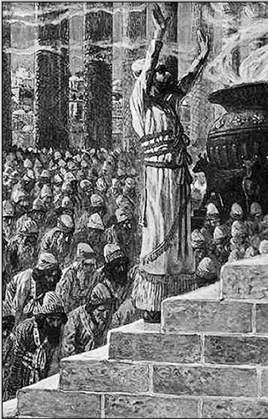
The dedication of Solomon's Temple.