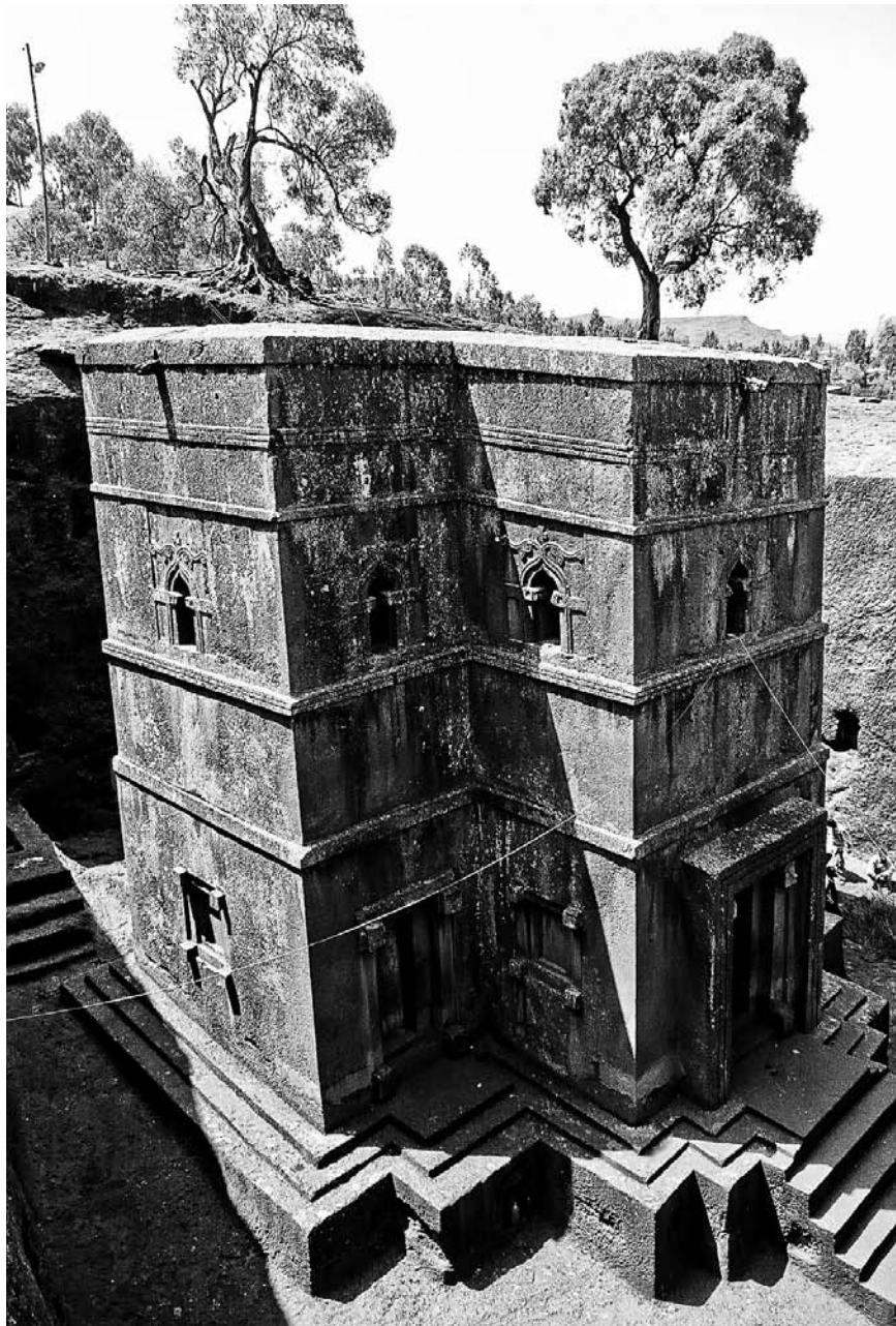
The Church of St. George, Lalibela, Ethiopia, carved into the ground in the early 13th century.