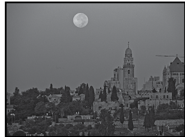
The sighted moon is used to mark the days of Sukkot.