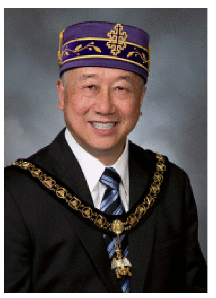
Sovereign Grand Inspector General Orient of California