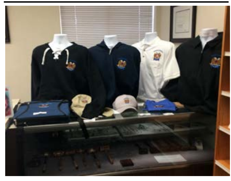
Visit the Pasadena Scottish Rite our online store. https://squareup.com/store/ScottishRite