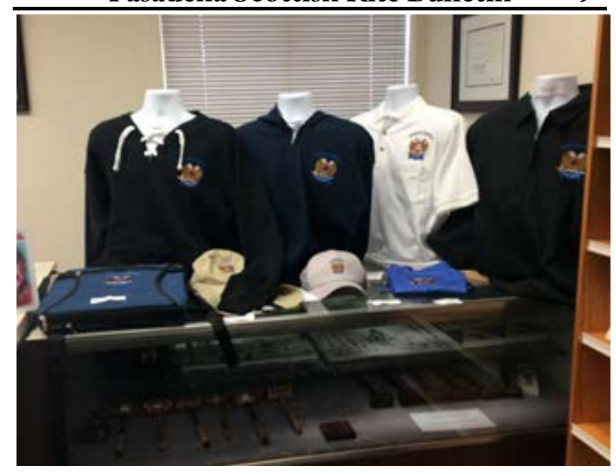
Visit the Pasadena Scottish Rite our online store. https://squareup.com/store/ScottishRite