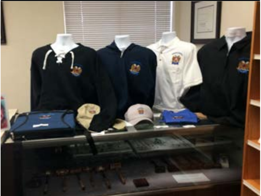
Visit the Pasadena Scottish Rite our online store. https://squareup.com/store/ScottishRite