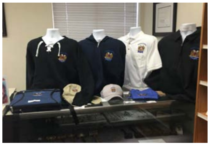
Visit the Pasadena Scottish Rite our online store. https://squareup.com/store/ScottishRite