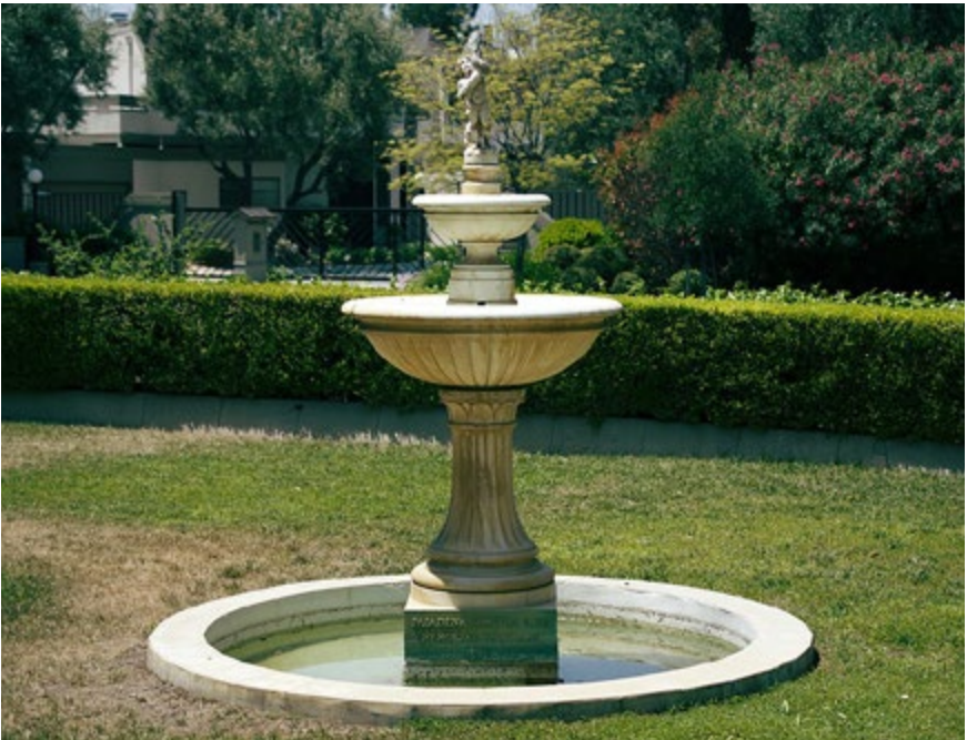
Pasadena Scottish Rite Memorial Fountain

Italian Marble Fountain donated to the Pasadena Historical Society by the Pasadena Scottish Rite in 1972 and now sits in front of the Fenyes Mansion, 470 W. Walnut St., corner of Orange Grove Blvd.