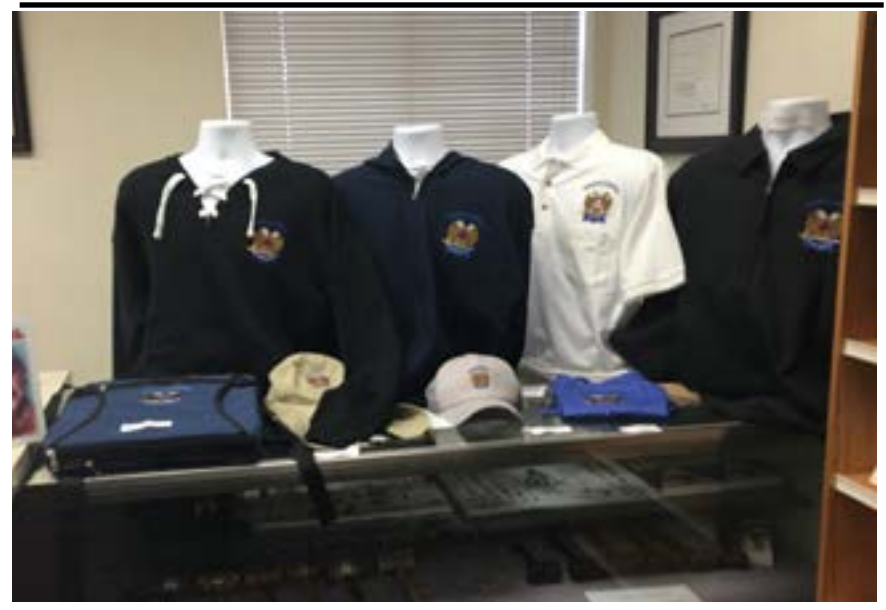
Visit the Pasadena Scottish Rite our online store. https://squareup.com/store/ScottishRite