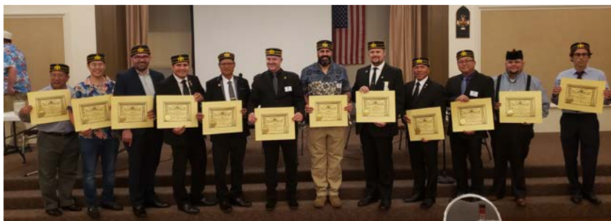
New members receiving thier patents at the July Meeting

Please take a moment to call upon your distressed brethren.