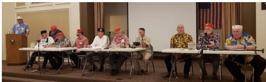
The Cast of "The Traitor" at the July meeting.