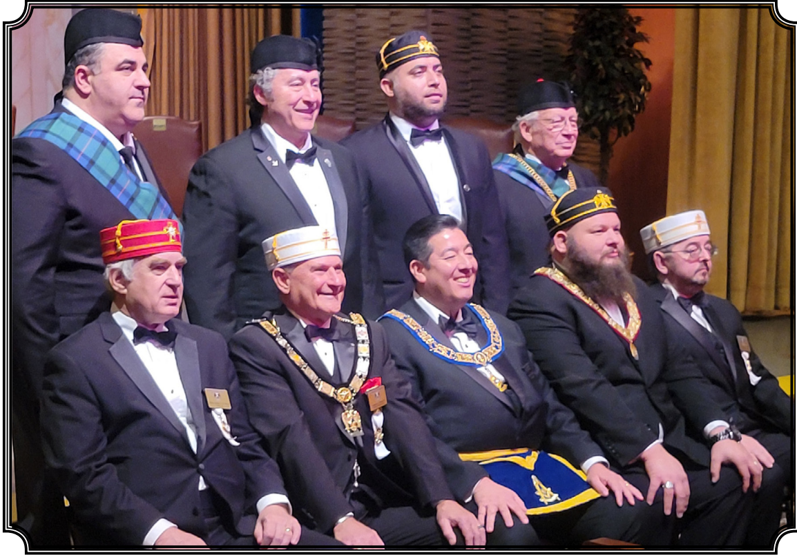
2025 Chapter of Rose Croix Officers Valley of Pasadena - April 2025