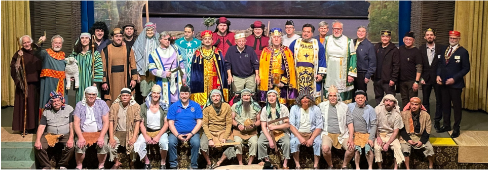
Cast and crew of the Spirit of Hiram performance held on March 14, 2025.

Please take a moment to call upon your distressed brethren.