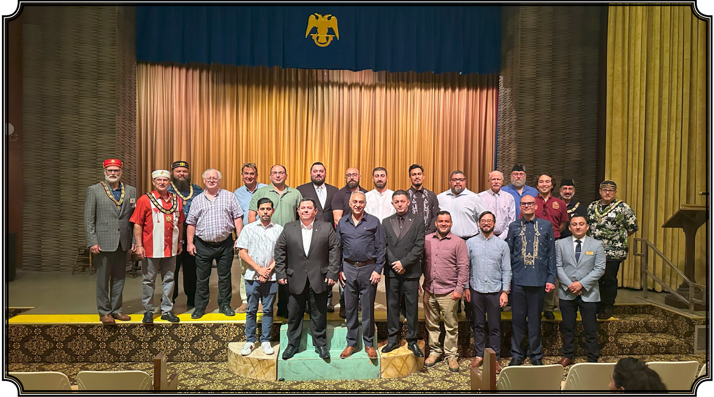
Ill Harry R. Sprague Memorial Class receiving their 14th degree rings. Vol. 88 Valley of Pasadena - September 2025 No. 8