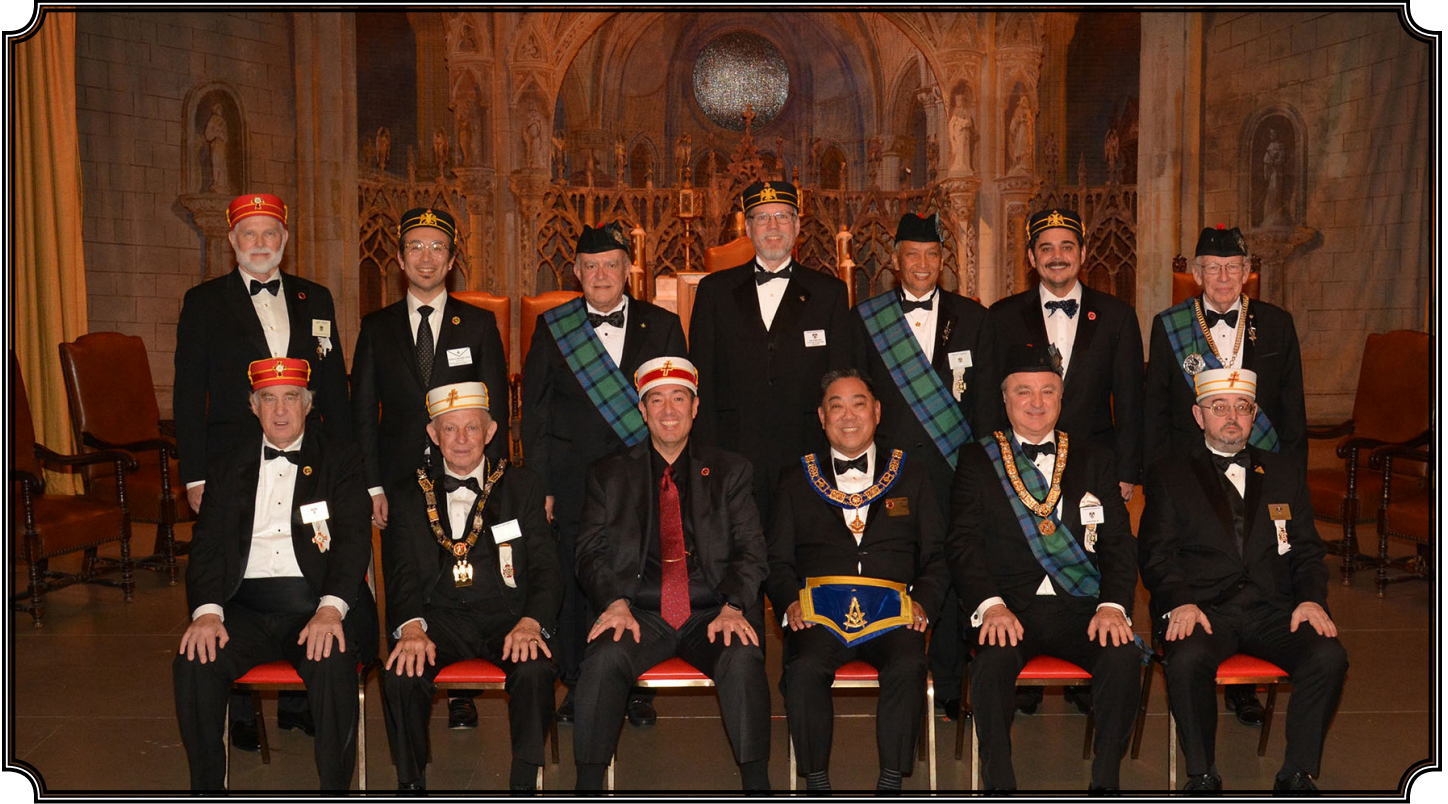
Council of Kadosh Officers