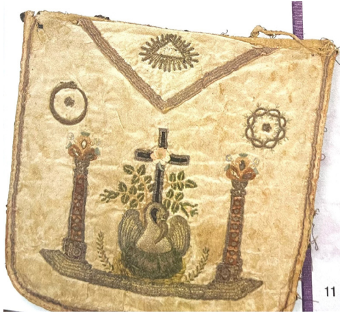
FRENCH ROSE CROIX APRON. THE BADGE OF A MASON.

A SELECTION OF APRONS FROM THE COLLECTION OF THE MUSEUM OF THE HOUSE OF THE TEMPLE ARTURO DE HOYOS, 33°, GRAND CROSS, K.Y.C.H.